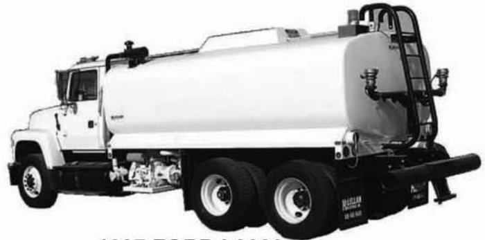
1997 FORD L9000 3600 gal. 'A' water system, engine drive