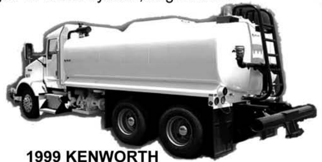
1999 KENWORTH 3600 gal. water system, engine driven