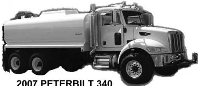
2007 PETERBILT 340 3600 gal. water system, engine driven