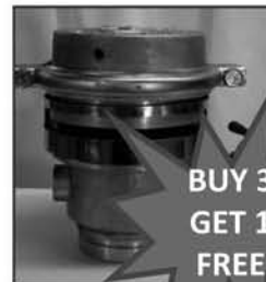
5 STAR WATER VALVE 5S-300