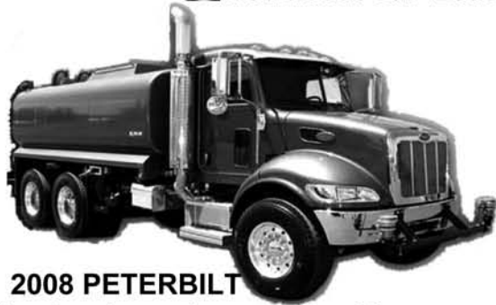
2008 PETERBILT 3600 gal. water system, engine drive Automatic transmission

Ask about our 'Lease To Own' Program Or Rentals on Fuel/Lube Trucks