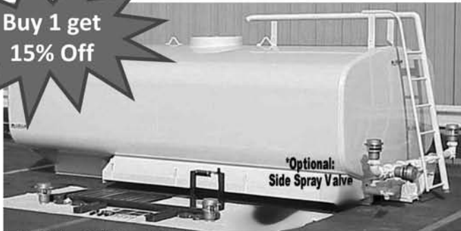
Tank Kits 2500, 3600, and 4000 gallon