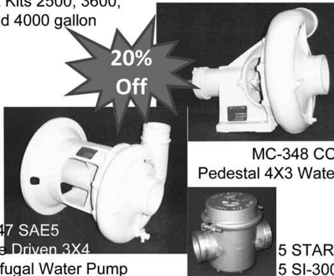
MC-347 SAE5 Engine Driven 3X4 Centrifugal Water Pump